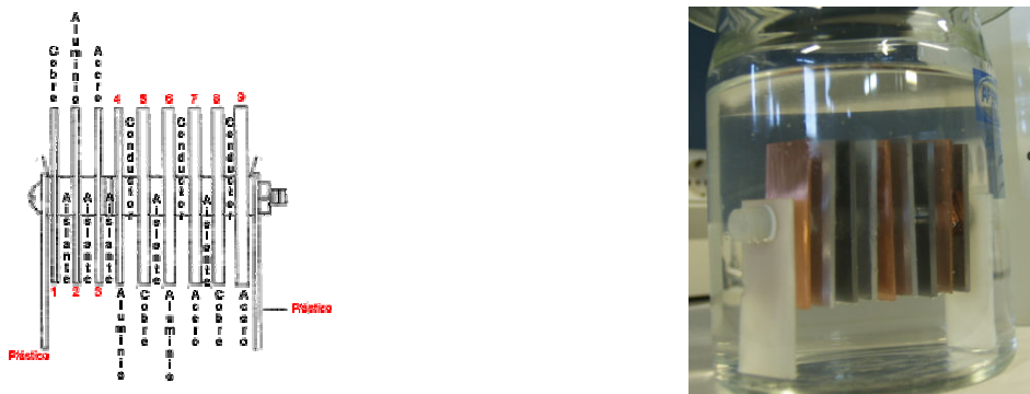
Figure 1: Metal disposition in the corrosion test. In 1 st , 2 nd and 3 rd position we placed aluminium, steel and copper isolated, avoiding formation of galvanic pairs. In positions 4 and 5, we formed galvanic pairs Al-Cu; in positions 6 and 7 Al-Steel, and in positions 8 and 9 we formed the pair Cu-Steel.

The formulation of this additives is based in a hybrid technology in a rate Water:Antifreezing 66:34 % to accomplish with the limits in the rule ASTM D-1384.